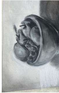
Still Life Like a Pro: Colour or Charcoal Challenge