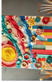
Mixed Media: Layers, Textures, and Color