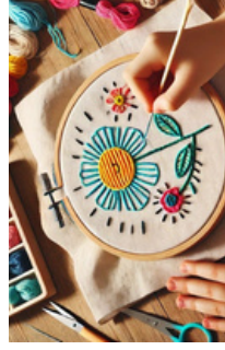
Stitch and Sketch: Turn Your Artwork into Threaded Art

book online @ www.theartfactory.com.au | 0400 468 673