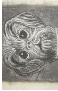
Reverse Charcoal Puppies: Mastering Light and Shadow