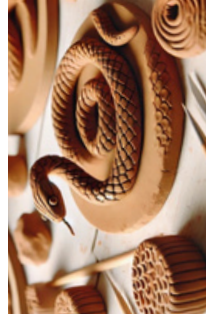
Be a Sculptor: Create a Textured Terracotta Serpent