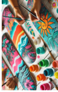
Design Your Own Skateboard Deck on a wooden Skateboard